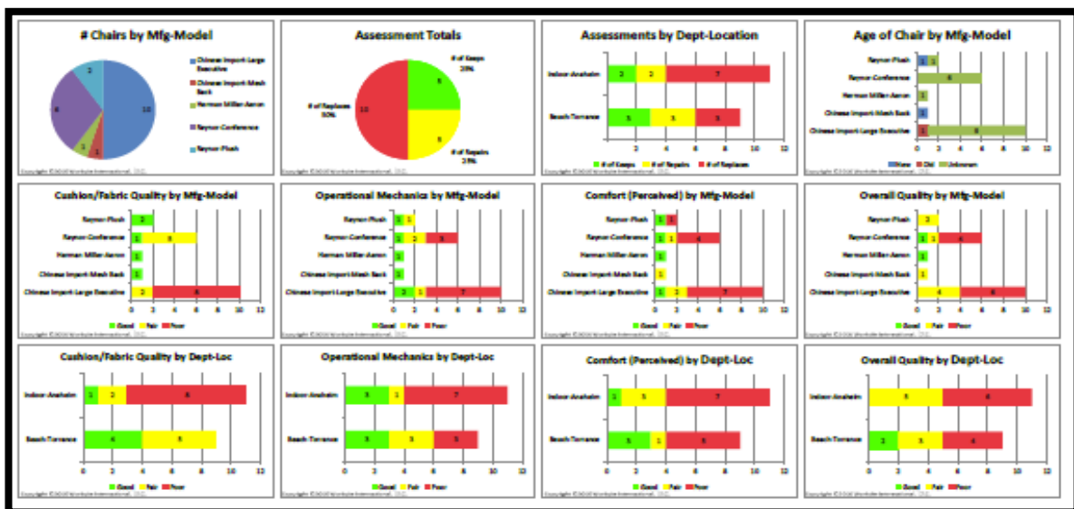
Figure 3. The Chair Assessment System dashboard helps to focus attention on key trends, comparisons and exceptions in the chair fleet.

The CAS database is also translated into a color-coded dashboard (Figure 3) to act as a visual interface that provides at-a-glance views into key measures relevant to the type of chairs the employer has, the location of the chairs and the quality and sustainability of the